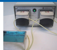
Art. No.: 155-01

The Liquid Level control was originally designed for Cedrex A/S Ultrasonic Tipwash system.